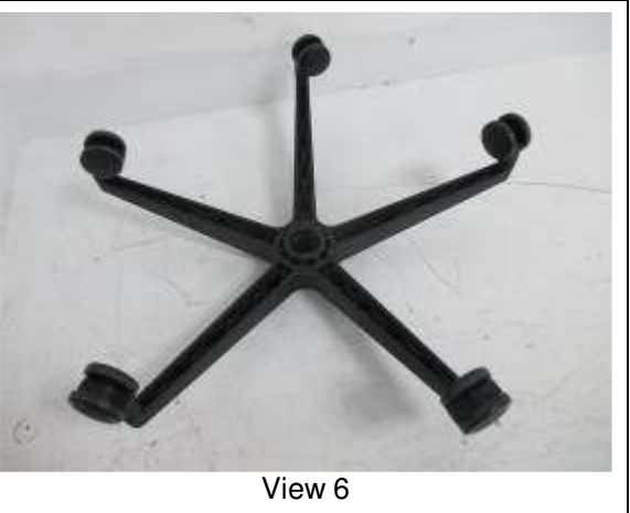
Test Pictures with Details